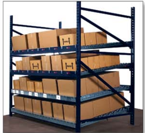
Dura-Flo provides maximum space utilization and flexibility.