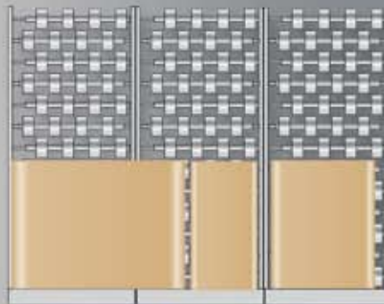
Dura-Flo Carton Flow