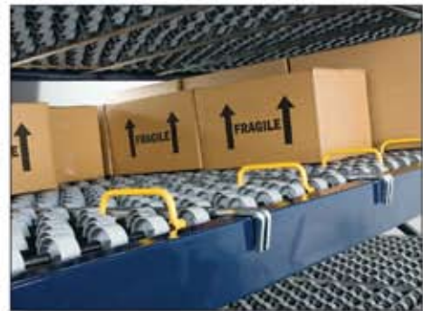
Dura-Flo Lane Indexers are easy to reposition.