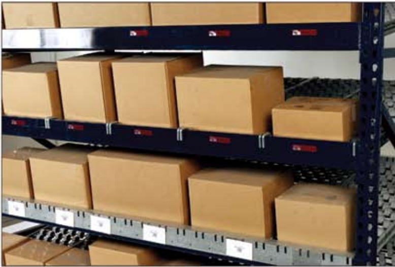
Dura-Flo offers beam hooks, beam hangers or extension feet.