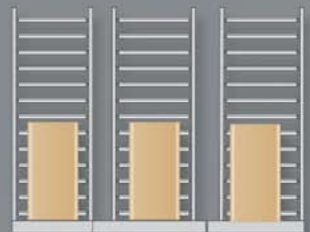
Alternative package flow systems can waste valuable shelf space.